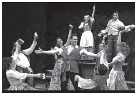
If you would like to play a leading role in Naperville's cultural community, then we want YOU on our board!