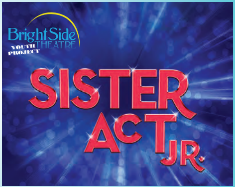
Register Now To Participate!