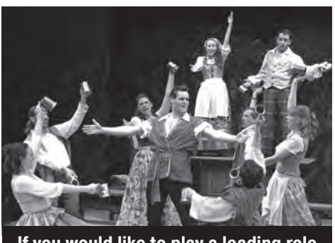
If you would like to play a leading role in Naperville's cultural community, then we want YOU on our board!