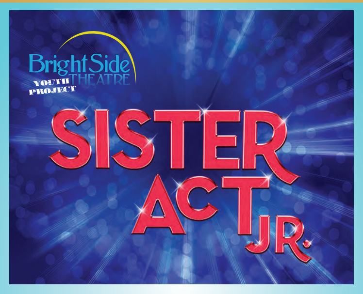
February 18 – 26, 2023

Subscribe and Save BrightSideTheatre.com | 630.447.8497